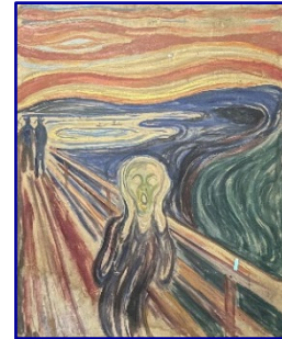
Courtesy recent visit to Munch Museum, Oslo, Norway.